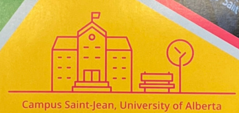
Campus Saint-Jean, University of Alberta

Registrations from April 2 to May 6, 2024